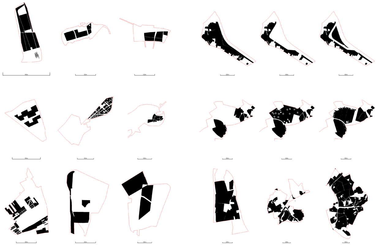
Fig. 1: Structural comparison of 14 of the analysed Productive Parks: outline and footprint of production areas (Timpe 2017, S. 492–493)