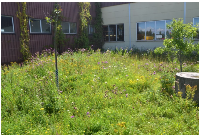
Figure 3: Sown meadow, Augustenborg, Malmö, Sweden.