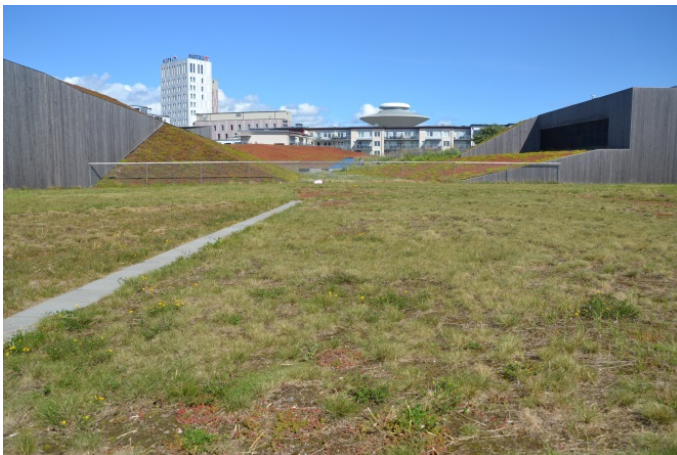
Figure 2: Green roof, Emporia shopping centre, Hyllie, Malmö, Sweden.